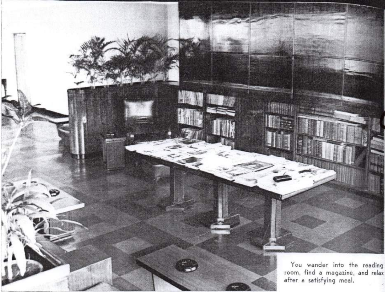
You wander into the reading room, find a magazine, and relax after a satisfying meal.