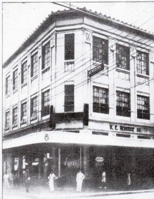
Philippines-wide service was the distributional ideal behind the erection of Heacock's Cebu Store, even now referred to as Cebu's finest building. Above left is the Davao branch of the company. Other Heacock's stores are located in Baguio, Iloilo and Bacolod. Complementing these "large" stores are a chain of agency stores located in thirteen municipalities in the island of Luzon.